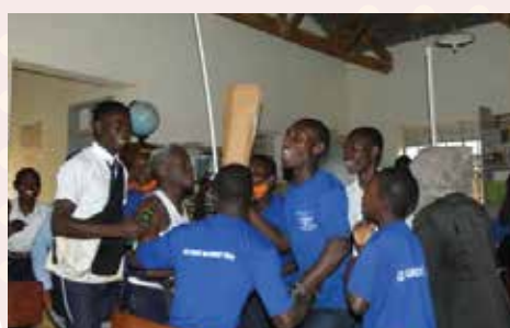
The heritage club members at Bulucheke Secondary School in Bududa perform the Imbalu, a circumcision dance of Bagisu