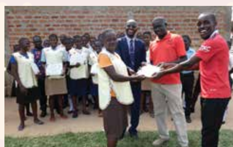
The outgoing leadership committee of the heritage club of Divine Secondary School in Bulisa received certificates for their service