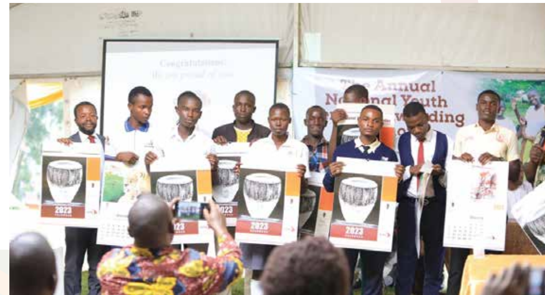
Winners of the 2022 competition at the awarding ceremony and launch of the calendar.

The competition focused on culture and leadership. Young people were tasked to draw or paint a symbol, object or item that demonstrates leadership in their communities. CCFU received over 475 entries from which 13 were selected to design the 2023 National heritage calendar. Winners of the competition were awarded in a grand ceremony at the Uganda National Museum in Kampala in December. At the event, CCFU launched a publication that profiles the efforts of young in safeguarding Uganda's cultural heritage.