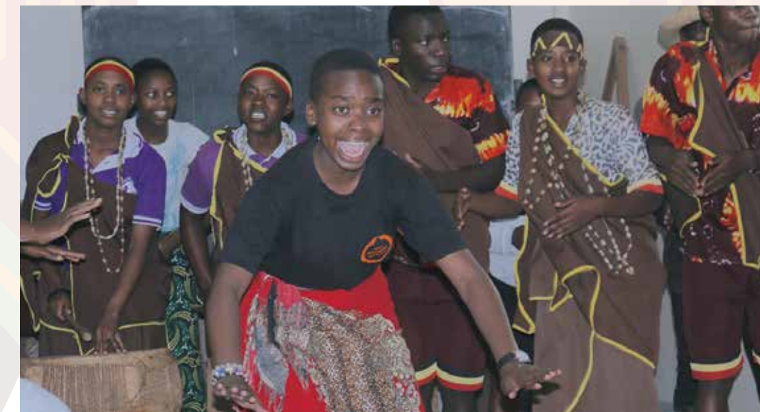
The Heritage Club of Kabale Secondary School perform a traditional folk song during the competition in Kabale.

CCFU held regional competitions in Soroti, Pakwach and Kabale focusing on folk songs and dances, traditional games, debates and speeches. The top 3 winning clubs from each cluster won cash prizes. The theme of the competitions was 'My culture promotes equality between boys and girls'