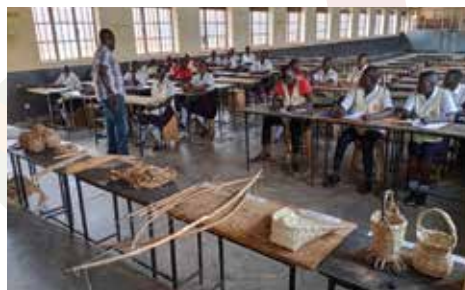
Heritage club members of Manibe Secondary School in Arua started a school museum.