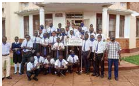
Buzaya Secondary School, Kamuli visited the Cultural Research Centre Museum in Jinja