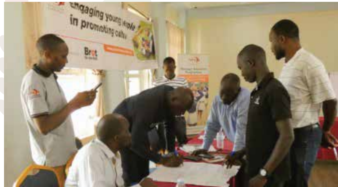
Coordinators during the training in Mbale

In 2022, about 130 school teachers (Bundibugyo, Ntoroko and Fort Portal) and Heritage Programme Coordinators were equipped with skills to support activities of the heritage clubs.