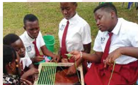
St. Joseph Vocational Secondary School in Nakasongora made crafts at the coronation ceremony of Isabaruuli (King) in Nakasongora