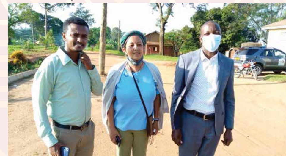
A team from Ethiopia visited the Pookino of Buddu (in a suit) during their bench-marking trip to Uganda to learn about the Heritage Education Programme experiences

In the last quarter of 2022, CCFU provided support to the establishment of heritage clubs in Ethiopia. 12 teachers or patrons were trained to establish and run vibrant heritage clubs. In 2023, CCFU plans to provide further support including resource materials, to heritage clubs in Ethiopia