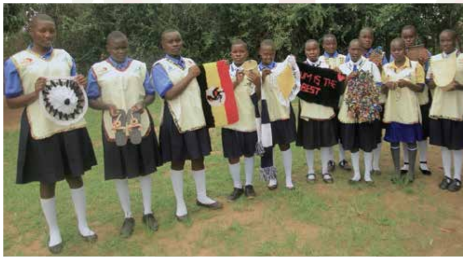
The Heritage club of Edioffe Girls SS in Arua made and sold crafts

Across the country, young people in cultural heritage clubs were involved in different activities such as traditional games, folk songs, debates, visits to community museums, end-of-year handovers by club executives and participation in CCFU's national youth cultural heritage competition.