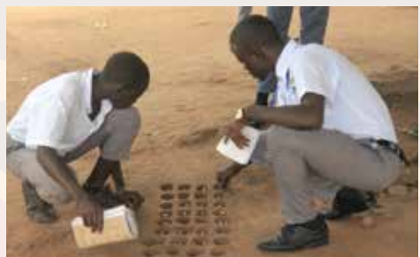
Young people playing a traditional game at Bishop Angelo Tarantino SS