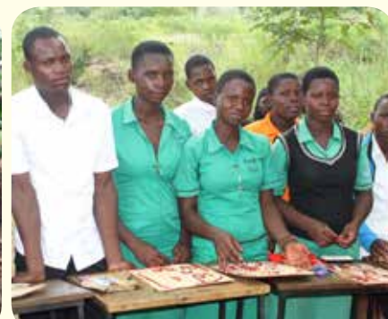
Making money out of beads, Nakigo Secondary School, Iganga

Young people contributing to the protection and promotion of Uganda's Cultural Heritage