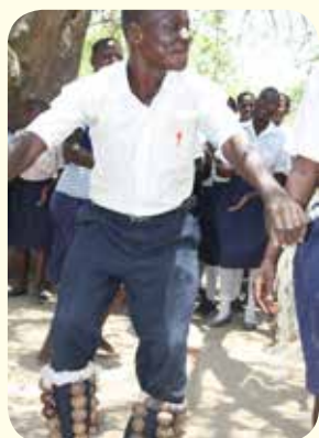
Runyeye Dance, Buliisa Secondary School Heritage Club