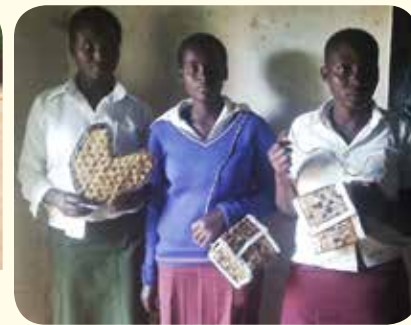
Making money from bags made from banana fibre, Kamuronko Secondary School, Kabale