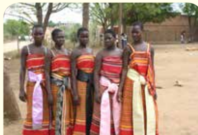
Promoting traditional wear, Kitgum Comprehensive College