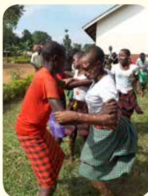
Karamojong Courtship Dance, Berkley Secondary School Heritage Club, Iganga