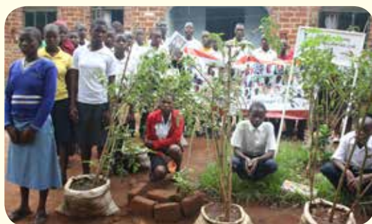
Tomato garden, Martin Luther Secondary School, Iganga