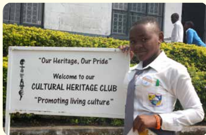
A cultural enthusiast from Kilembe Secondary School, Kasese