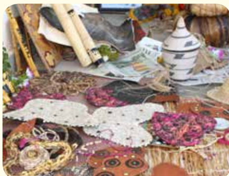
Cultural exhibition, Kiteredde Vocational Institute,