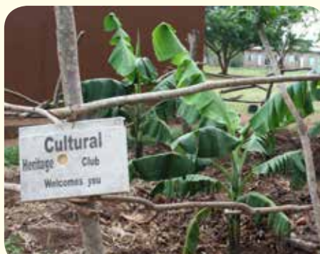
Banana garden, Kigulu College, Iganga