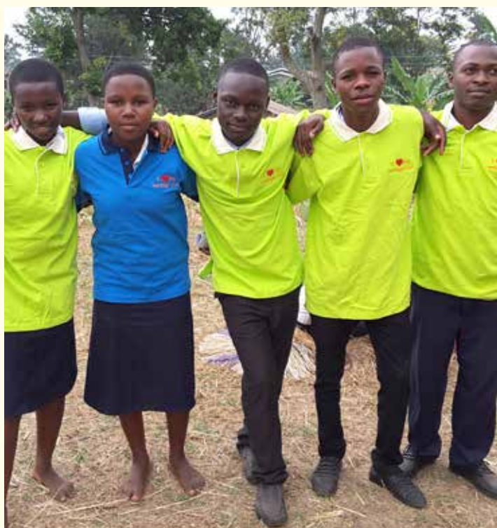
Young people contributing to the protection and promotion of Uganda's Cultural Heritage