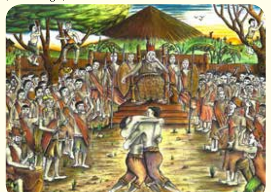
Winning illustration for 2016 Competition by Joshua Muyinza

To participate, young people up to the age of 20 years are required to draw or paint any traditional dance, indicate its local name and why it is important in their community. The deadline for submitting entries is 1st September 2017 .