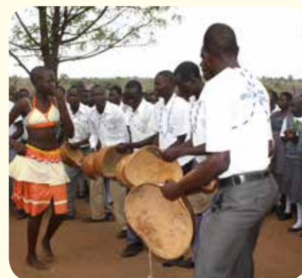
Lakaraka Dance, Kitgum Comprehensive Collge