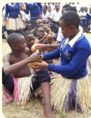
Folk song/Dance, St. Charles Secondary School, Kasanga, Bwera