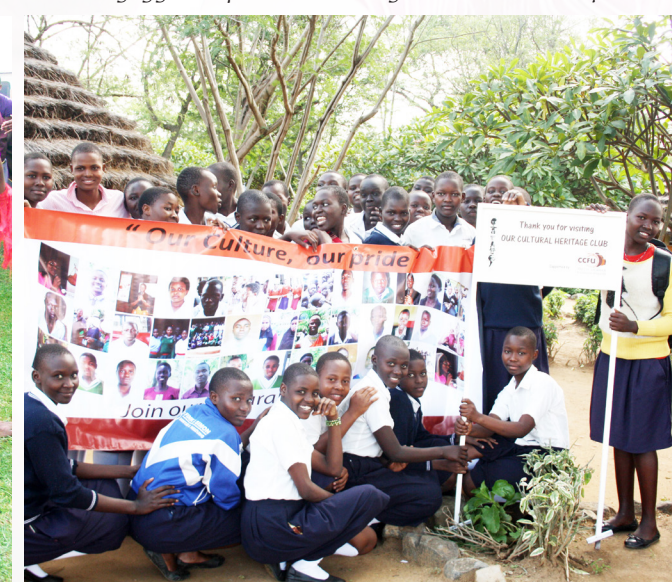
Club members at Kangole Girls, Napak district after receiving a banner and sign post for their club