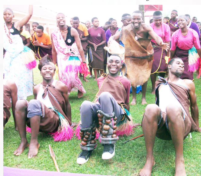
Club members at Kabale Trinity College performing Ekizino, a traditional dance for the Bakiga