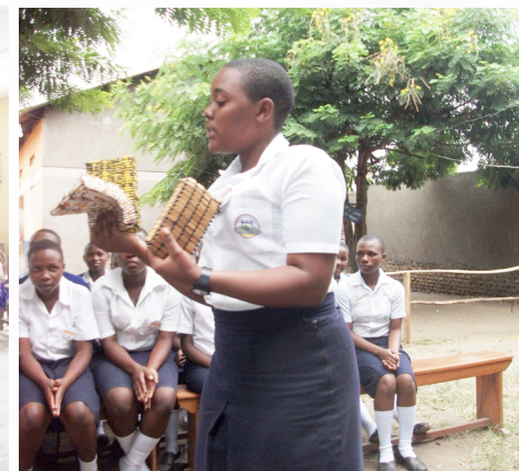
Club members at Bright academy in Kasese displaying handcrafts