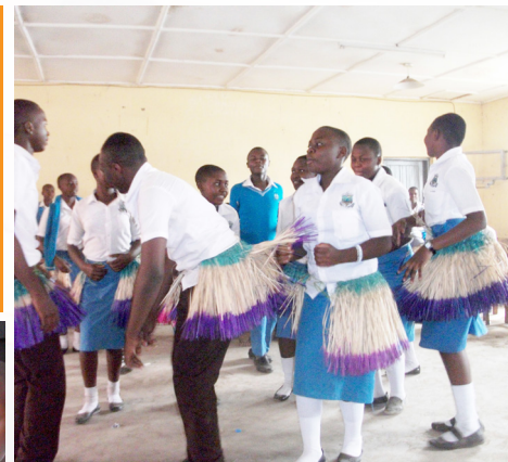
Heritage club members at Bwera SS, Kasese performing Ekiyebe dance for Bakonzo