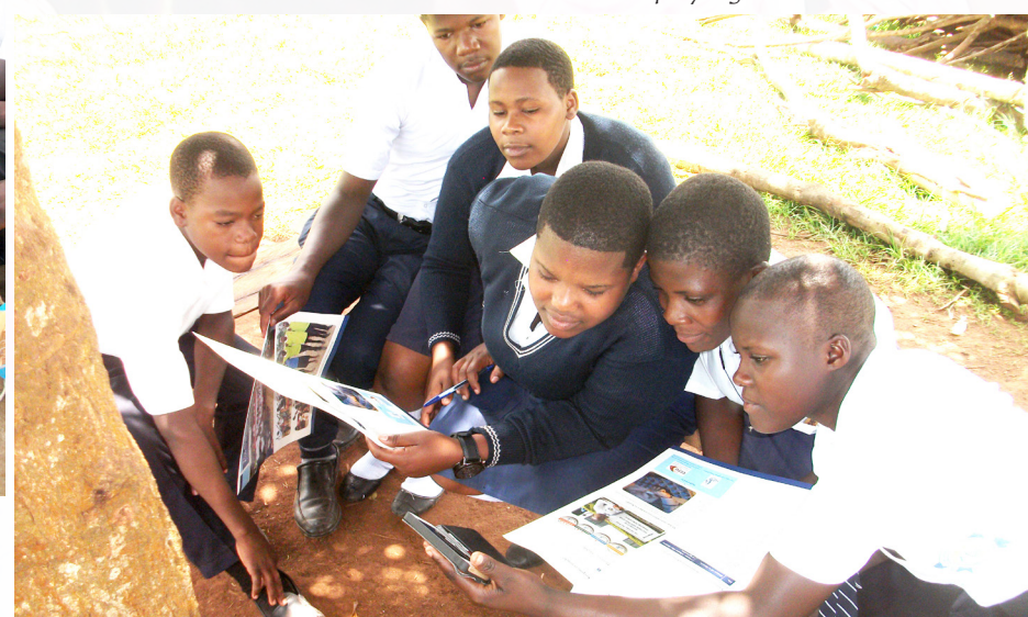
Heritage club members at St. Mugagga SS Jjalamba reading the 2016 HEP report