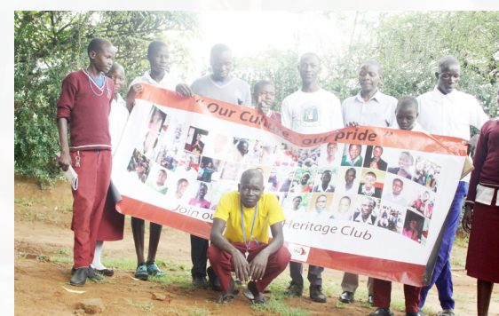
Heritage club at Moroto High School receiving a banner for the club

In 2017, 23 new heritage clubs joined the programme in the clusters of Mpigi, Moroto and Kampala. Club patrons were trained and given copies of the heritage toolkit