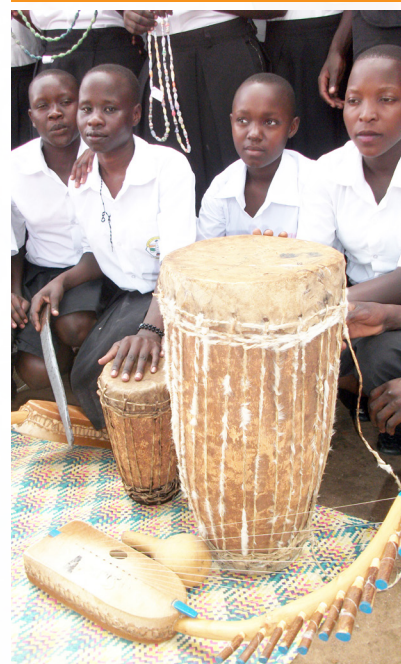
Music instruments made by the club members at Manibe Public School, Arua